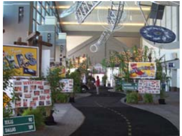
5000 Attendees - 9 Venues - 13 Techs - 4 Days - 25 Wireless - 48 EV XLC127+ Line Array Boxes