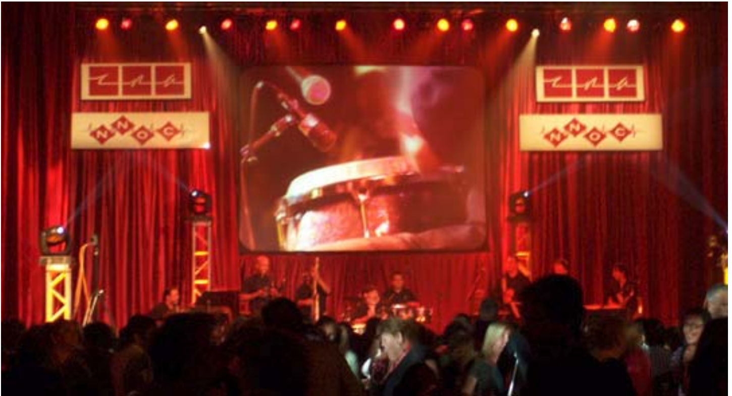
2007 CNA Conference, Sacramento - Featuring: Holly Near, Pancho Sanchez & Harry Bridges Project