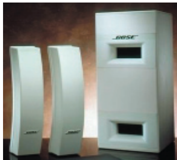
Media Rooms, Classrooms